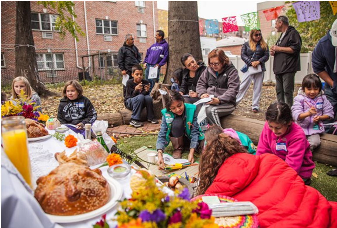
At the Hibrodos Art Collective's Day of the Dead celebration kids enjoy a picnic and write poems.

24. Plant daffodils and write poems at a Day of the Dead celebration at a unique-to-Jackson-Heights location: Leverich Cemetery , a 17th-century burial ground that used to be part of a family farm. During the warmer months, Hibridos Art Collective sponsors several other events there, as well.