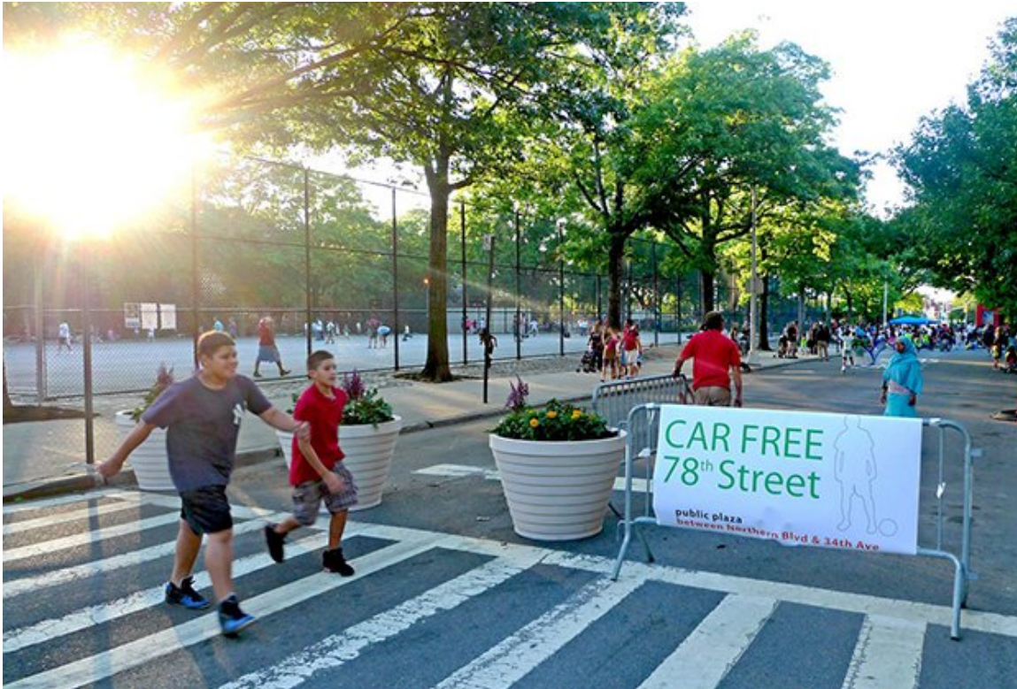
Play Street is open to pedestrians, not cars, year round.

To make it a little easier to find those great Jackson Heights gems with your children, we've compiled a list of neighborhood highlights. Enjoy!