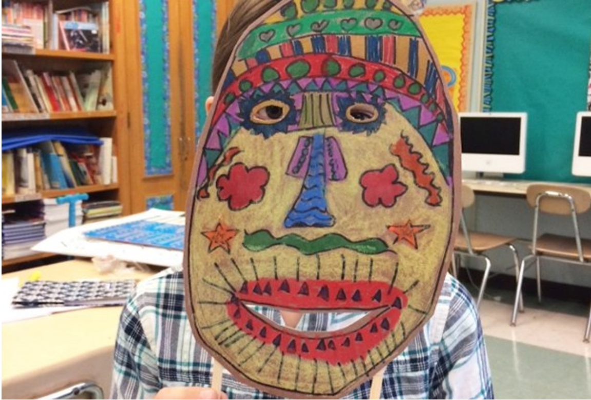
Get creative after school with Art for a Start.