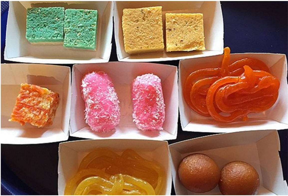
Pick up some Indian desserts at Raibhog Sweets.